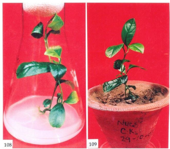
Figs. 108-109: Cultures of Citrus karna

Figs. 106-107: Proliferation of cotyledonary embryos and in situ germination of some of them